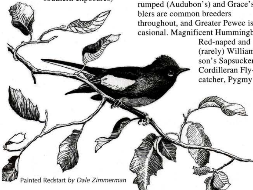
Painted Redstart by Dale Zimmerman

Hutton's Vireo is scarce but fairly regular here, mainly where gray and Gambel's oaks mingle with pines; the common vireos are Plumbeous and (in the cottonwoods) Warbling. Most years, the Greater Pewee may be heard singing in the mixed conifer woods near McMillan Campground, a mile or so farther along the road. The above-named warblers, plus Yellow-rumped and Olive, should be looked for in and above the small campground and up the adjoining wooded canyons. Northern Pygmy-Owl, formerly regular here, is now hard to find, but imitating its call to attract passerines sometimes stimulates the owl itself to call. Flammulated and Spotted Owls are also possibilities, especially in narrow McMillan Canyon. Both Whip-poor-will (on mesic, north-facing slopes) and Poorwill (on drier southern exposures)